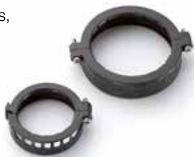
POLO-KAL NG ASV